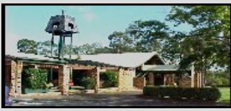
St Bernard's Church 4 Klumpp Rd, U M G