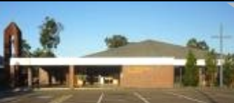
St Catherine's Church 388 Newnham Rd, Wishart