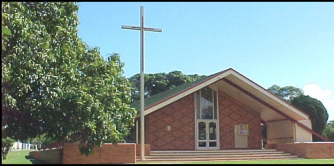
St Martin's Church Cnr Logan & Chester Rds, Eight Mile Plains